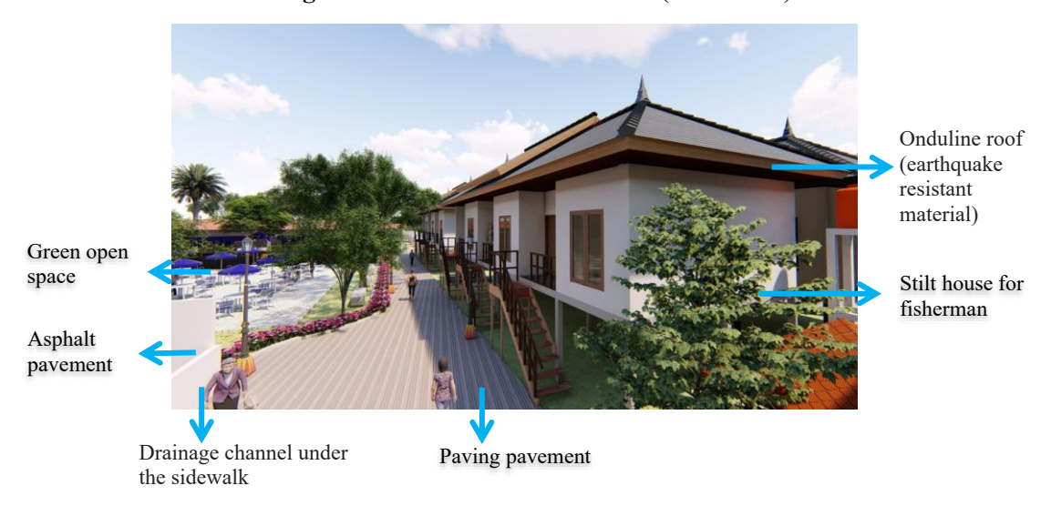
Figure 5. Planning of fishermen's settlements in Kuta (Mandalika)

Based on facts above, the planning of fishing village in Kuta beach (Mandalika) is proposed as Figure 3 until Figure 5. Figure 5 illustrates that a healthy environment can be planned by designing environmentally friendly infrastructure. For example: for fishermen's settlements, houses are designed on stilts so that if sea water rises, water will not enter the house. The building materials are also