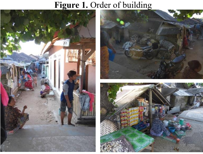
Figure 2. House building and waste conditions