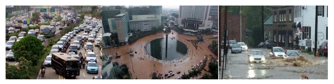
Figure 1. Floodwaters in Central Jakarta in January 2013