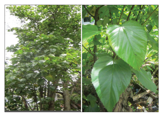
Fig. 1: Plant Melochia umbellata (Houtt) Stapf var. degbrata K