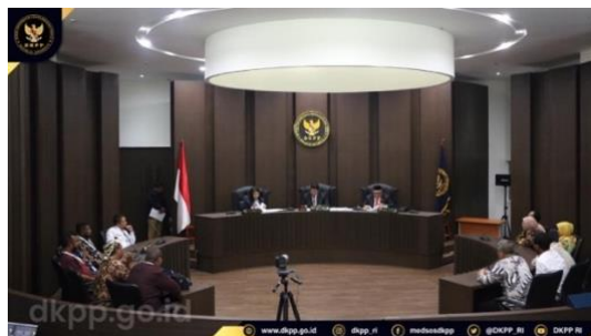
Figure 1. Election Organizers' Code of Conduct Hearing

In the table above, we can see the accumulation of the total number of ethical cases based on the decisions submitted to the KPU during 2018-2020. Three hundred forty decisions of the code of conduct case ensnared the KPU from various levels, namely KPU RI as many as 33 times, KPU Province as many as 44 times, and KPU Regency/City many 263 times. When compared to the documents of the DKPP decision file analyzed, the total number of verdicts does have a difference in the number. However, the difference in the number between the documents of the results of the verdict amounting to 315 and the accumulated results of a total of 340 occurred due to the existence of several documents resulting from the decision of the DKPP in which it stipulates two or three levels of the KPU as the complained party in the lawsuit.