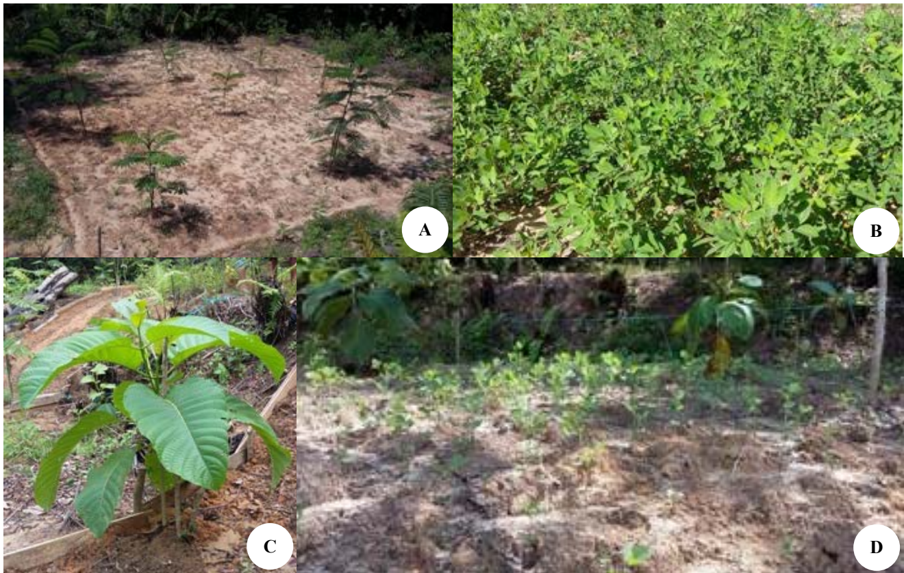
Figure 3. A. Falcataria moluccana , B. Arachis hypogaea , C. Anthocephalus cadamba , and D. Glycine max

There was no difference between depreciation cost for the application of an agroforestry system of F. moluccana - A. hypogaea and that of A. cadamba - G. max because the kind, quantity, and price of equipment were same. There were many kinds of equipment needed to support farm activity. The equipment was hoe, chopper, sickle, and sprayer. The price of this equipment was different and it depended on the material and the quality of the equipment. Technical duration of an equipment is commonly three years. However, sprayer can be used for five years. Depreciation cost in the application of A. hypogaea and G. max as intercropping in two agroforestry systems was lower than material cost and labor cost.