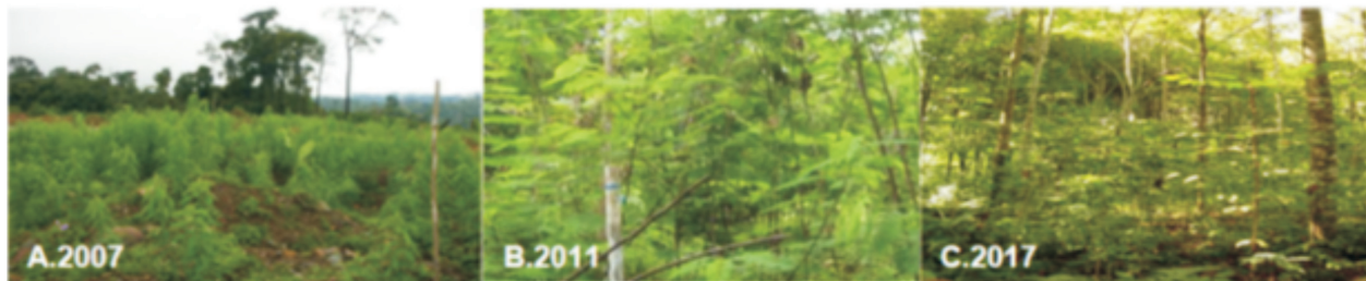
Fig. 3. View of vegetation growth: A. 2007, B. 2011, C. 2017 (Lower Nakan Plot 164)

Conservation biology is the management of nature and of earth's biodiversity with the aim of protecting species, their habitats, and ecosystems from excessive rates of extinction and the erosion of biotic interactions. Therefore, conservation biology addresses the dynamics and problems of perturbed species, communities, and ecosystem (Lei et al. , 2015). Forest fragments exhibit striking changes in the vicinity of their borders, known as edge effects (Laurance, 1997; Laurila-Panta et al. , 2015). These effects are driven by microclimatic changes which occur in forest edges (Pinto et al. , 2010). Microclimatic changes in turn cause a general increase in mortality of plant communities as well as increased turnover and growth (Laurance et al. , 2002). Empiri-