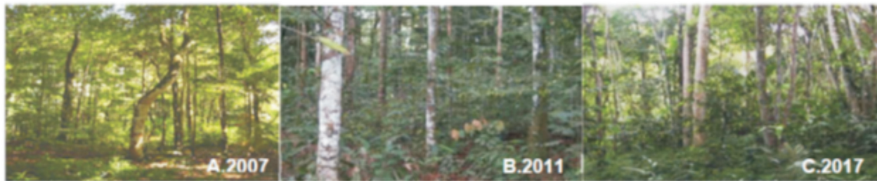
Fig. 6. View of vegetation development at rehabilitated mined-out forest lands: A. 2007, B. 2011, C. 2017 (Lingau Plateau)

cal studies shows that changes in composition are related to their functional type, late-successional, shade-tolerant species showing abundance decline at forest edges, and early-successional, shade-intolerant species increased abundance (Oliveira et al. , 2008). Emergent trees are also vulnerable in small edge-effect dominated areas, and their loss contributes to a reduction biomass values (Dantas de Paula et al. , 2011).