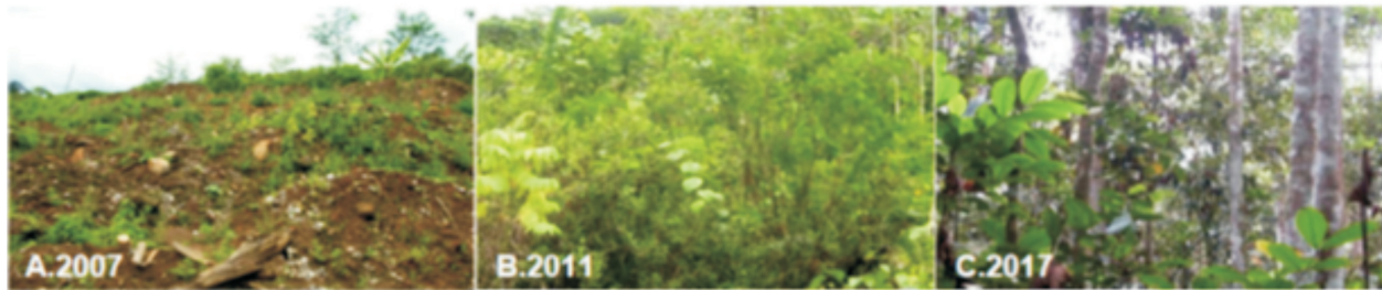
Fig. 5. View of vegetation development at rehabilitated mined-out forest lands: A. 2007, B. 2011, C. 2017 (Lower Bayaq Plot-85)