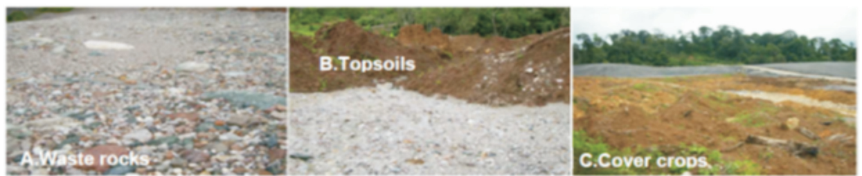
Fig. 2. Initial condition of minedout forest land : A. land preparation layered waste rocks, B. Topsoils spreading, and C. Planting cover crops (2006)

Upper Nakan (Plot-138) is characterised by big size rocks over layered with topsoils spreading and tree planting in 2007. Octomeles sumatrana decreased in number. Similar case occurs of Macaranga hypoleuca which is dying due to wild plants e.g. Ipomoea sp and Meremia sp . Wild plants were Calliandra calothyrsus , Melastoma polyanthum , Trema canabina Lour., Widelia trilobata , Piper aduncum L., Musa sp. , Hibiscus tiliaceus , Mimosa pudica , Nauclea subdita , Sesbania grandiflora Poir., Passiflora foetida , Trema