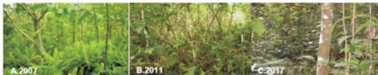
Fig. 4. View of vegetation growth at rehabilitated mined-out forest lands: A. 2007, B. 2011, C. 2017 (Upper Nakan Plot-138)