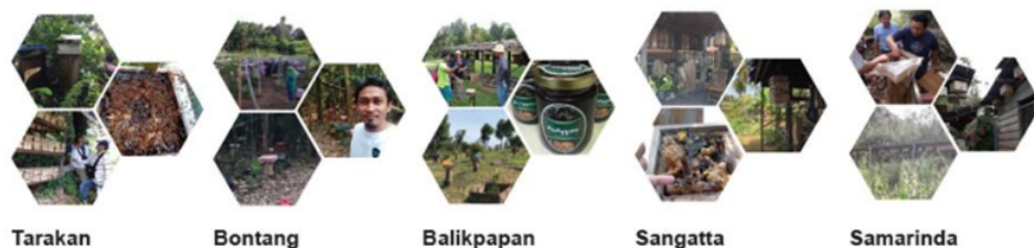
Figure 3. Meliponiculture in East and North Kalimantan.

Beekeeping and meliponiculture not only positively contribute to income gain, but also plays a role in increasing food security. Some communities in North and East Kalimantan already cultivate it with various methods, packing the honey, sell it to the local markets, and they also share their knowledges to other communities (Figure 3). However, beekeeping activity and its potential receive only subordinate attention within the Indonesian government and the public. According to scientists from Padjadjaran University (Dr. Mahani SP., M.Si., UNPAD, Bandung, Indonesia), bee businesses are mostly considered as a part-time farming activity. Not only parts of the local community, but also