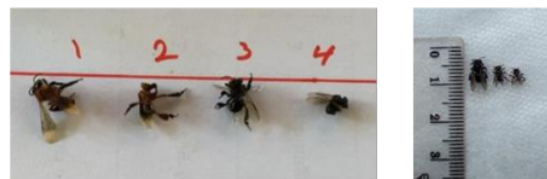
Figure 2. Species and sizes of Kelulut (stingless bees); 1. Homotrigona fimbriata ; 2. Geniotrigona thoracica ; 3. Heterotrigona itama ; 4. Tetragonula laeviceps .

Stingless bees have populated Earth's tropical regions for over 65 million years, which is longer than Apis spp. (the stinging honey bees) have existed [2]. Both honey bees and stingless bees make honey in perennial nests founded by a swarm of sterile female workers and a queen. Colonies maintain workers at all times and also males during certain times of the year. However, stingless bees are 50 times more diverse than the honey bees and differ from them in many biologically significant ways [8]. Within the Family Apidae, stingless bees belong to the Tribe Meliponini. Considered eusocial non- Apis bees, meliponines have extremely diverse morphology, nest building (nidification) habits, behavior, and ecology. They are small to medium-sized bees (2–13 mm in length) (Figure 2) with considerable variation in colony population size (from several hundred up to more than 10,000 workers per colony). They also exhibit a high rate of brood production and require substantial pollen intake [8].