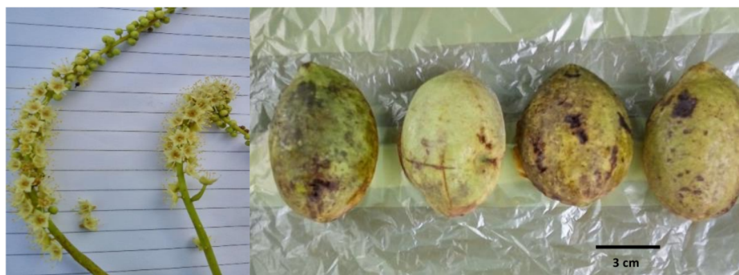
Figure 3. Flower and fruit of tropical almond in Tenggarong, Kutai Kartanegara regency, East Kalimantan, Indonesia

Information on physical environmental characteristics grouped by elevation is shown in Table 4. Physical environment characteristics observed are light intensity, air temperature, relative humidity, soil temperature and pH. Statistical analysis of physical environment characteristics of T. catappa trees based on elevation shows that the light intensity and relative humidity are not significant. On the other hand, air temperature, soil temperature, and pH are highly significant.