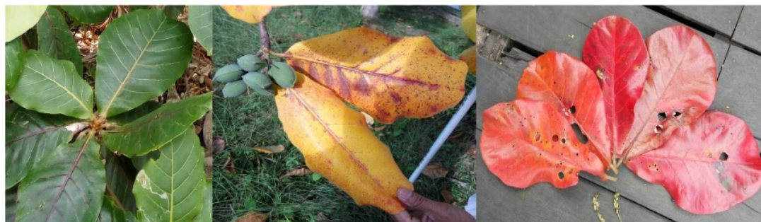
Figure 2. Terminalia catappa leaf color change identified during the research activity