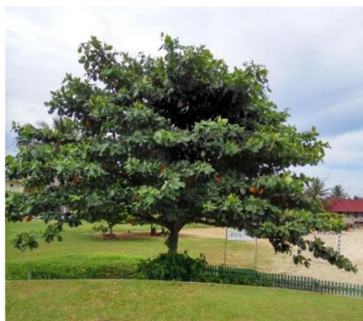
Figure 4. Terminalia catappa (Tropical almond tree) planted on the beach in Balikpapan East Kalimantan, Indonesia

The fruit is 4.46 to 6.71 cm length, 3.32 to 4.19 cm width, ellipsoid, more pointed at the apex than at the base, slightly flattened, with a prominent base around both sides and at the tip, whereby this form contributes to its ability to float in a long distance in the sea. A seed will be found inside the fruit and a fully ripe seed is edible. It tastes similar to almond, hence it is named like that. The seed is ready to eat when the fruit turns red. Just like many other fruits and berries, the almond tree fruit is green at first, then yellow, and finally red when ripe (Figure 3).