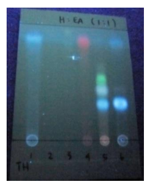
Figure 2 The Chromatogram of Fraction TH (1–5).

The TLC profile at fractions TH1-TH5 showed a good separation on n -hexane and ethyl acetate solvents in the ratio of 8: 2 on the appearance in Figure 2. Fraction TH6 shows a single spot that is almost pure.