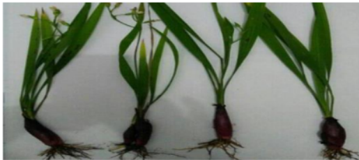
Fig. 1. Dayak Onion

Dayak onions or ghost onions which have the scientific name Eleutherine palmifolia (L.) Merr is typical plant in the Kalimantan region. This plant is traditionally used by the Dayak tribe as a medicinal plant. It has a red tuber color with green leaves in the form of ribbons and white flowers. Dayak onions can be used as an alternative medicine to treat dental caries. This is because Dayak onions contain phytochemical compounds, namely alkaloids, glycosides, flavonoids, phenolics, steroids, and tannins [3], [21]. The content of these chemical compounds can inhibit and kill bacterial activity. Dayak bulb extract which can inhibit bacterial growth has the advantage of natural properties of herbal plants which are relatively safe for the body. "Fig. 1" shows the shape of the Dayak onion plant.