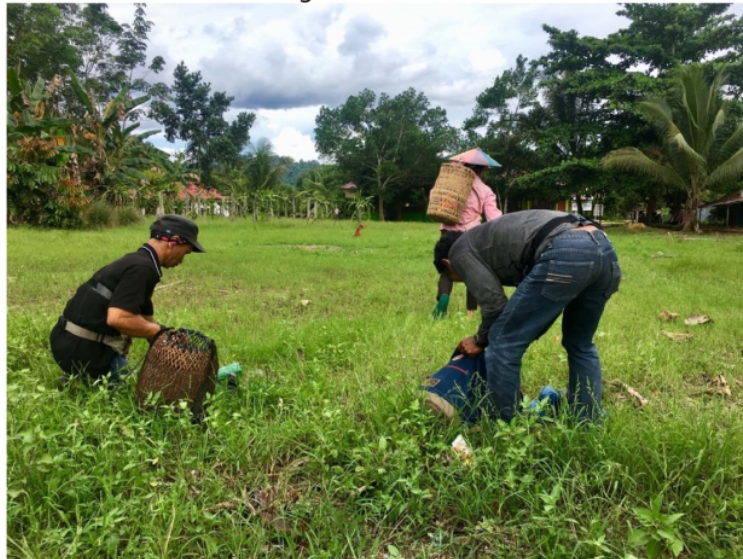
Figure 2. Examples of experimental setting sites.