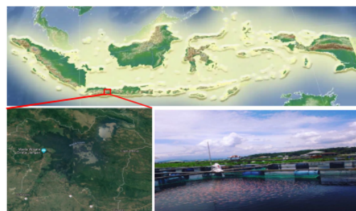
Figure 1. Study location at Cirata Reservoir, West Java, Indonesia.

After the discovery of ectoparasites attached to the parts of the fish, the number of parasites was counted and then photographed using a camera and identified using the book Parasitologi Ikan: Biologi, Identifikasi dan Pengendaliannya and the book Foundation of Parasitology (Schmidt and Robert, 1996) then entered the observation table. The microscope used was a Yazumi brand microscope XSZ-107BN.