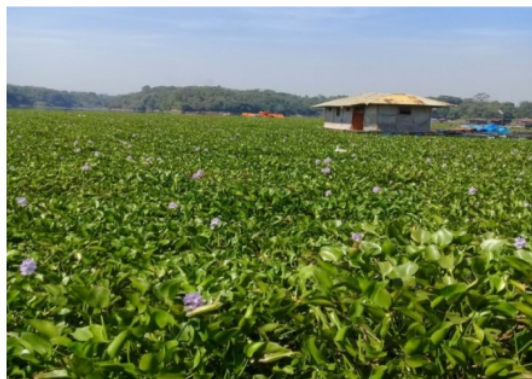
Figure 4. Blooming of Hyacinth ( Eichhornia crassipes ) in Cirata Reservoir.