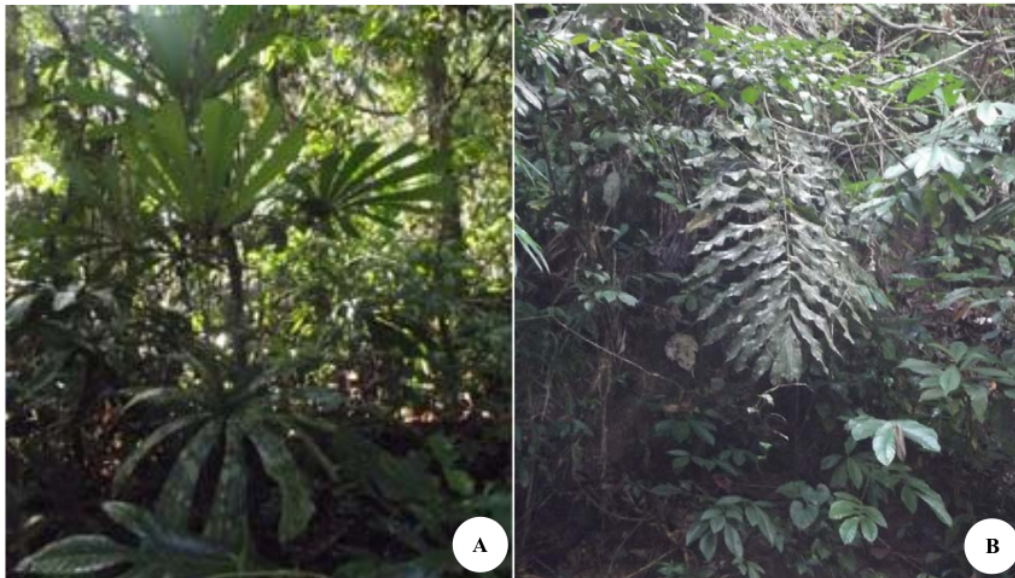
Figure 4. NTFPs from Setulang Village Forest, Malinau, North Kalimantan, Indonesia. A. Lucuala valida Becc. B. Korthalsia furtadoana

NTFPs are feasible for cultivation, but will require intensive support).