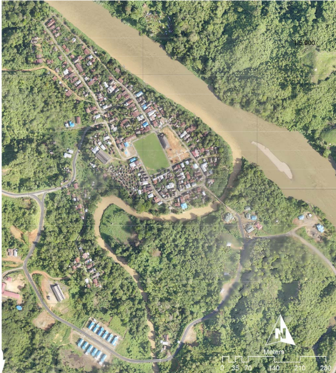
Figure 3. Distribution pattern of Uma Longh residents of Setulang Village, Malinau, North Kalimantan, Indonesia

The common perception of the Uma Longh community of the forest near the village fosters prudent harvest of forest products. NTFPs are not only obtained from dense forests, but also in the former fields and the settlements, depending on the community's experience to select and process them into NTFPs that are economic 20 viable. Uma Longh Setulang community only utilizes non-timber forest products (NTFPs) in small volumes to meet the