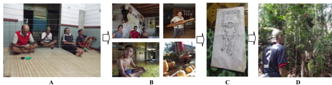
Figure 2. Data sources. A. Focusing Group Discussion, B. Deep interview, C. Documentation, D. Transect survey