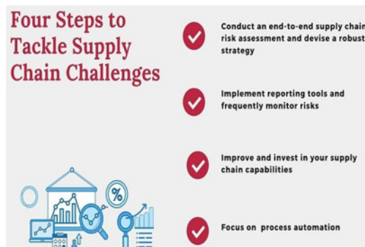
Fig.1: Supply chain strategies and challenges

The government is committed to continuing to work very hard as a form of seriousness in handling Covid-19. This commitment is formulated through the making of public policy (strong public health policy response) related to the handling of the outbreak in the form of drug and medical device supply chain management.