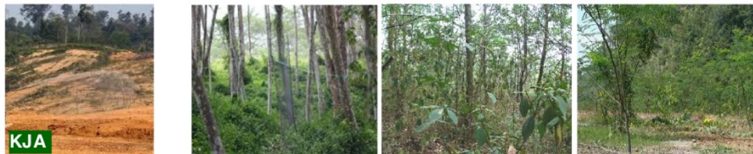
Figure 8. Rehabilitated lands management at KJA ( fast growing and primary species > 12 years )