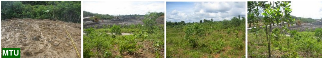
Figure 5. Rehabilitated lands management at MTU ( fast growing species 4-5 years )