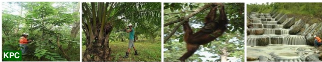
Figure 7. Rehabilitated lands Management at KPC ( fast growing, primary species > 10 years, palm oil, soil and water conservation structure )