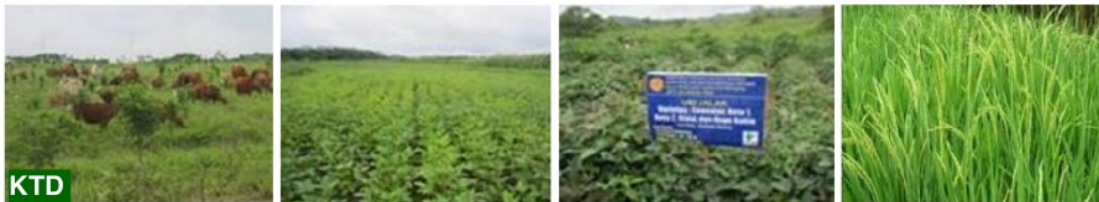
Figure 6. Rehabilitated lands management at KTD ( fast growing and agriculture commodities 1-2 years )