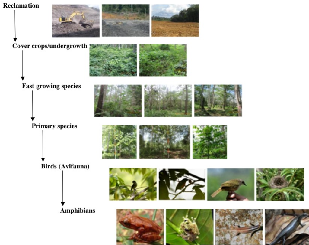
Figure 9. Steps in the rehabilitation processes and the recovery processes showing land coverage by vegetation and the invading wildlifes-birds (avifauna) and amphibians (herpetofauna)

To conclude, the most important factors and stages for land recovery are topsoils spreading (thickness and density), land preparation (planting hole, soil amendment/amelioration materials), planting (plant materials, techniques), and rehabilitated forest lands management (replanting dead trees, maintenance, fertilization). The potential recovery of mined forest lands can be shown by revegetation plants (land cover crop and fast growing species grow combined with undergrowth and interlayered crown, primary species are interline planted, decreasing soil erosion rate (erosion hazard class: very low to moderate, erosion hazard level: very slight to moderate, decreasing overland flow increasing soil infiltration capacities), and invading animals (wildlife) feeding, multiplying and ecosystem regeneration. Mined forest land potential recovery could be assessed through soil characteristics, overland flows, infiltration capacity, soil erosion and sedimentation, revegetation plants, invading wildlife and ecosystem status. Degraded lands are continuously recovering, the mined lands being on the right track to be recovery in time, as indicated by interaction between ecosystem components of forest ecosystems, hydro-oro-logical conditions, improved microclimate, and