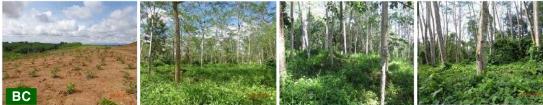
Figure 4. Rehabilitated lands management at BC ( fast growing and primary species 10-12 years )