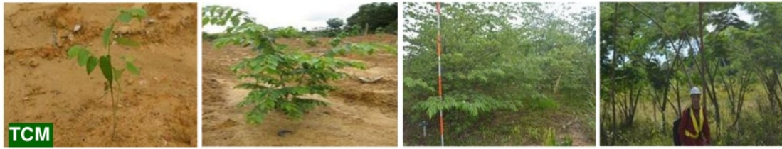
Figure 3. Rehabilitated lands management at TCM ( fast growing species-4 years )