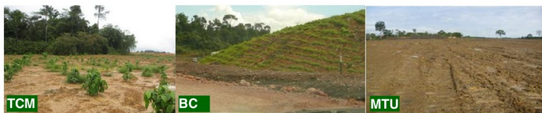
Figure2. Planting after reclamation works at TCM ( fast growing species ), BC ( land cover crops ), and MTU ( land preparation-planting holes )