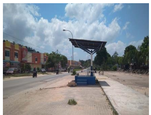
Picture 2: Batam Public Transportation Facilities