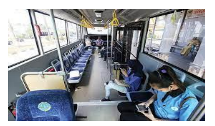
Picture 5: Transportation without Facilities for Special Needs Observation, 2023