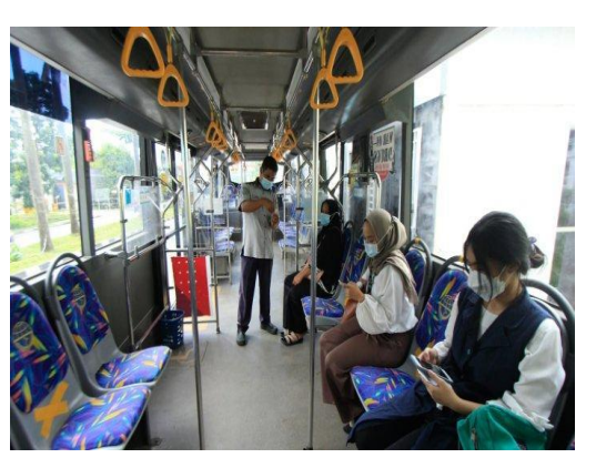
Picture 3: Batam Public Transportation Facilities

The two pictures above depict the current state of the public transportation facilities which can mean that these facilities are not accessible to persons with disabilities. Limitations not only on physical accessibility but also on non-physical accessibility such as service information or the availability of public transport accessibility information are not widely known by the public, this indicates that the implementation of the provision of facilities for disabled public transport has not run optimally. This is indicated by the ineffectiveness of the Bus Rapid Transit (BRT) system in Batam City. Conceptually, the goal of the BRT system is to create conditions that are fast, comfortable, safe and accurate in terms of infrastructure, vehicles and schedules. Based on the results of the interview with the Program planning sub-section, The Technical Planning (Mrs. Irma Rika) and documentation to achieve this system, the government has launched the SIPTB Trans Batam Service Information System (SIPTB) application, however, now this service has not been accessible to all members of the public.