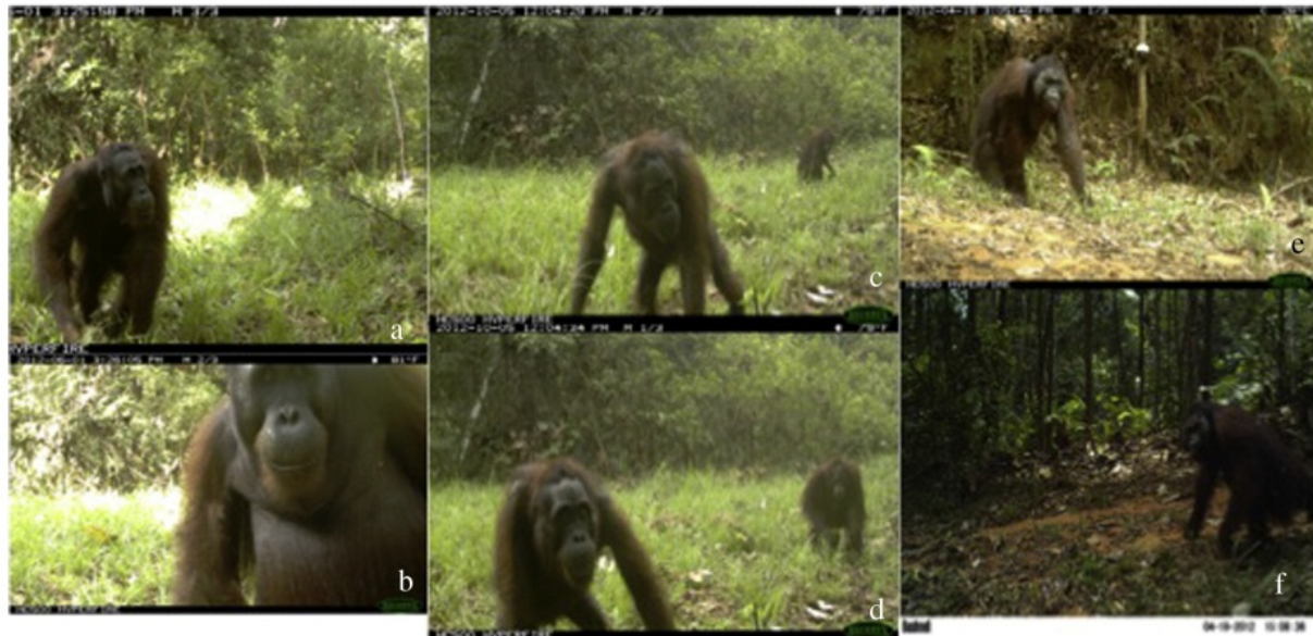
Figure 2a (top) and 2b (bottom). Two photos from one record of unflanged male.

We estimated SCR model parameters using Maximum Likelihood Estimation (MLE). To obtain the MLEs of the SCR model parameters it is necessary to prescribe a 2-dimensional region within which individual home range centers may exist. This region is called the state-space ( S ), and the population size parameter N corresponds to the number of individuals having home range centers within this region. While the population size is sensitive to the size and configuration of the state-space, the density of individuals, D , defined as N divided by the area of the state-space S , is invariant to the size of the state-space under standard SCR models (Royle et al., 2013; p. 132). For our analysis we defined the state-space by buffering the minimum area rectangle containing the sample locations by 7.5 km. The total area of this state-space is 568.8 km 2 . This buffer around the sample locations is at least 4 times the estimated value of \sigma .