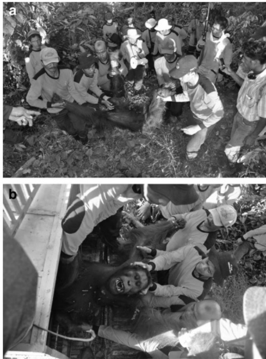
Fig. 3. (a,b) Unflanged adult male El (38 kg) at the time of capture. Note his emaciation, which accounts for his exceptionally low body mass.

using such techniques to assess body condition in wild primates, although care must be taken to maximize the likelihood of obtaining standardized photographs. Ideally, if researchers begin regularly collecting such information for orangutans (and other primates), these data could be contributed to an open-access database that would allow comparisons of body mass/conditions across a range of geographic locations and habitat types, and could provide the ability to monitor population status over time. As orangutan habitat becomes increasingly fragmented and altered by humans, the need to make conservation decisions about orangutans living in human-dominated landscapes will become more frequent. Baseline data on body mass and physiological indicators of health from populations living in less disturbed settings and comparative data from animals living under various regimes of disturbance will be critical to our ability to make informed management decisions.