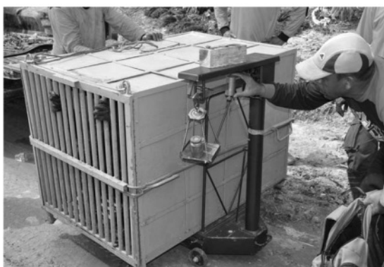
Fig. 2. Obtaining body mass data from captured orangutan.

Variables considered include forest cover, connectivity, patch size, distance from nearest natural forest patch, and other factors that might influence the likelihood of conflict with humans (distance to nearest village, offices, or staff habitation). Relocation is always the last resort and is only done when there are no viable alternatives.