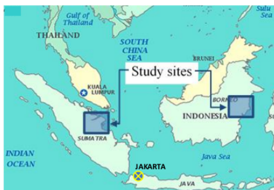
Figure 1. Study sites for Imperata cylindrica grassland biomass and carbon inventory in Sumatra and Kalimantan, Indonesia

Root biomass was sampled and collected at 16 drilling points in each plot to a depth of 3 m (using an 8-cm-diameter root auger in 15-cm increments) distributed on a systematical sampling basis (Figure 2). In some cases a less-weathered parent material layer was found at 3 m depth, presenting a physical barrier and preventing sampling for deeper soil layers. Roots were separated from the soil core by water saturation and flushing; soil cores were watered in small flasks overnight for soil suspension. In the case of heavy clayey soils (common for soil layers deeper than 50 cm), calgon (sodium polyphosphate) was added to the suspension to enhance the dispersion capacity of the soils. Hereafter, the suspension was rinsed under a medium pressure water tap and the roots were collected with 2-mm and 65- \mu m sieves. The samples were processed following the same procedure as for aboveground biomass samples.