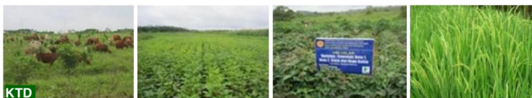
Figure 6. Rehabilitated lands management at KTD ( fast growing and agriculture commodities 1-2 years )