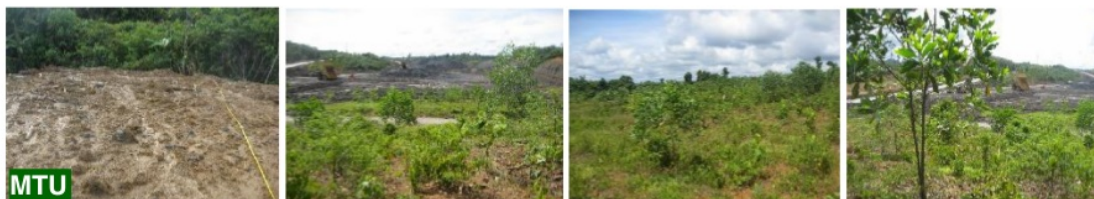
Figure 5. Rehabilitated lands management at MTU ( fast growing species 4-5 years )