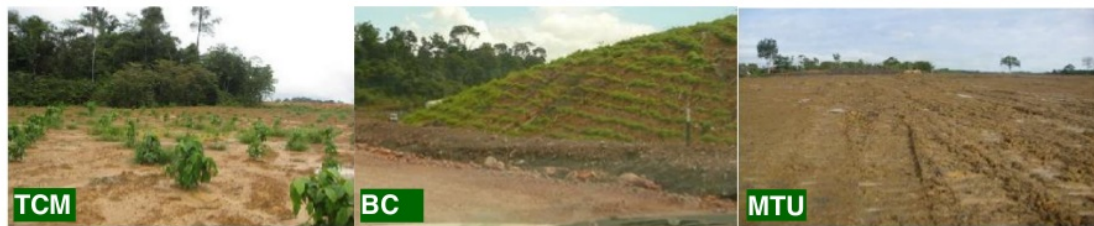
Figure2. Planting after reclamation works at TCM ( fast growing species ), BC ( land cover crops ), and MTU ( land preparation-planting holes )