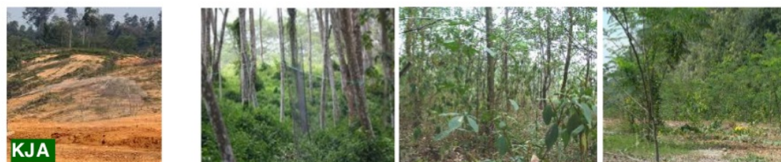
Figure 8. Rehabilitated lands management at KJA ( fast growing and primary species > 12 years )