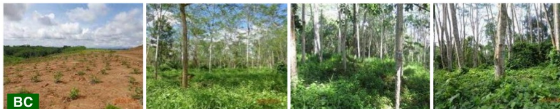
Figure 4. Rehabilitated lands management at BC ( fast growing and primary species 10-12 years )