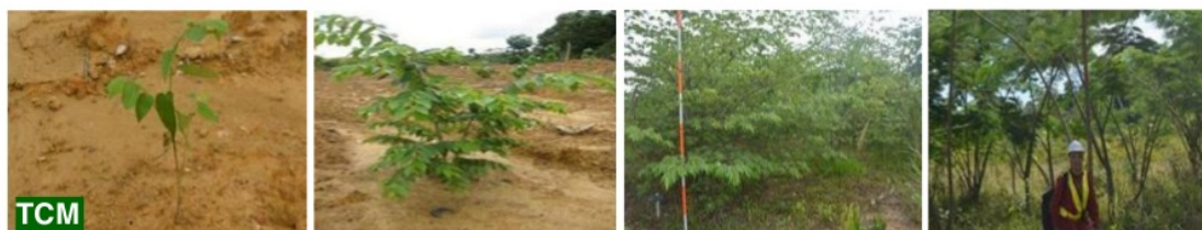
Figure 3. Rehabilitated lands management at TCM ( fast growing species-4 years )