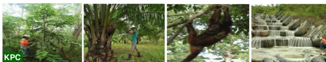
Figure 7. Rehabilitated lands Management at KPC ( fast growing, primary species > 10 years, palm oil, soil and water conservation structure )