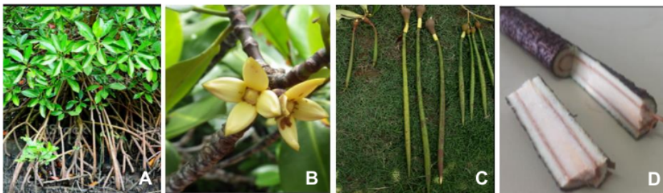
Figure 1. (A) plant mangrove R. mucronata , (B) flower, (C) cigar-shaped propagules (D) longitudinal section of root [24-25].