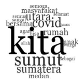
Figure 9: North Sumatra governor's attention to Covid-19 coordination and communication.

East Java is currently the region with the most Covid-19 cases after DKI Jakarta. This was predicted due to the residents' high mobility. Hence, the governor's twitter account (figure 8) serves a very important purpose. The pandemic has become a major concern among the inhabitants, as a result, there is a need to convey all relevant information including government management policies and public participation requirements. Furthermore, the words "Indonesia" and "we" are often used to imply a joint effort in saving the country and the need to comply with implemented health protocols.