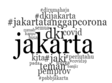
Figure 5. The Attention of the Governor of DKI in Communication and Covidence Handling Covid 19

Figure 4 shows the three main concerns of the Indonesian Task Force in handling the pandemic, including "Covid, Kita, and #dirumahaja". This institution formed Indonesian government facilitated the coordination of activities between institutions, in an effort to prevent and mitigate the disease impacts new in Indonesia. Therefore, the massive socialization of related information was performed very naturally, as observed with the availability of detailed information about Covid, and how to break the distribution chain. Furthermore, the Indonesian Task Force, in line with Jokowi, also explained all of us (government and society) as the main key to proper management. This is effectively conducted by staying and performing activities at home to inhibit spread, experienced mainly after direct contact in public spaces.