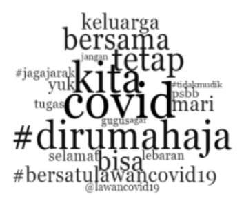
Figure 4. Attention of the Task Force in Communication and Covidence Handling Covid 19

aspect of behavior, according to established health protocols. Jokowi, as the highest holder of power in government, and also the main person in charge of handling the pandemic, ought to convey several explanations regarding the policies for proper management to be implemented. This is performed as a form of government's seriousness.