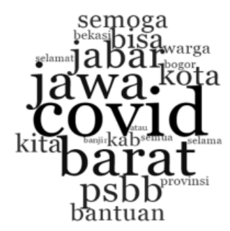
Figure 6: West Java Governor's attention to Covid-19 coordination and communication.

"Teman" was used an expression towards the community's contribution. This was also selected due to the symbolism of greater familiarity, distance and millennial impression.