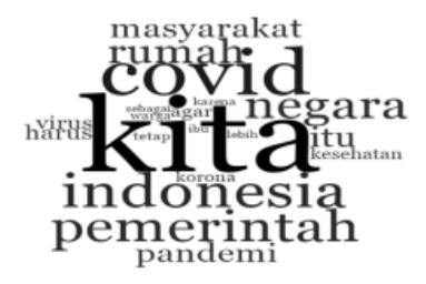
Figure 3. President Jokowi's Attention in Communication and Covidence Handling Covid 19

Jokowi (30%) performed a similar study, and explained the economic and social impacts incurred as a result of Covid-19. Furthermore, several coping strategies were observed to have been implemented. The we can do campaigns (11.8%) organized in Central Java to fight Covid-19 (11.4) was aimed at arousing the optimism of Central Java indigenes in the combat against the virus amid existing limitations. The transmission chain, for example, is possibly suppressed by the individual's willingness to stay at home or strictly implement health protocols in life. In addition, a similar pattern was observed by the Covid-RI Group (8.7%). Meanwhile, North Sumatra (26.85%) and NTB (7.61) focused on "We Are Together" as an important handling instrument to convey the message on cooperation, help and sacrifice of all parties. The South Sulawesi region emphasized on viruses (30.77%) to explain the dangers of Corona as a virus and measures appropriated by the government to overcome.