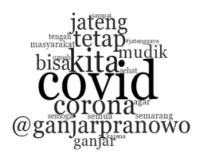
Figure 7: Central Java Governor's attention to Covid-19 coordination and communication.

West Java is one of the five Indonesian regions with the most covid-19 cases. Figure 5 shows the governor's twitter account (@Ridwan Kamil) is used to convey basic information about the disease's transmission as well as preventive measures and the province's name is often mentioned in this communication. This is because the disease's management is the provincial taskforce chairman's duty. Furthermore, this platform is used to elucidate response, rationalization and development programs. The words "Javanese" and "western" appear even more frequently than West Java, but are already implied by the region's name, and therefore, not counted. The other keyword is "PSBB", a policy created to stop Covid-19's spread in the district. This program's effectiveness depends on the authorities' socialization. Through this social media platform, awareness is increased in a bid to flatten the pandemic's curve.