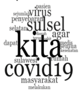
Figure 10: South Sulawesi Governor's attention to Covid-19 communication and coordination

Figure 9 indicates the governor makes use of three key words and all response policies as well as recommendations issued by the Provincial government are in accordance with the residents' common interest. Therefore, compliance, solidarity, and cooperation are expected from the community. In addition, the word "North Sumatra" is mentioned to convey developments in the region's corona virus cases, management policies, and encourage public participation in the province. Also, "Covid" is used to emphasize the dangers presented by the pandemic as well as preventive measures.