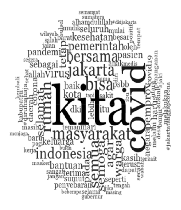
Figure 2. Discussion Issues in Communication and Coordination of President Jokowi, the Governor and the Covid-19 Task Force