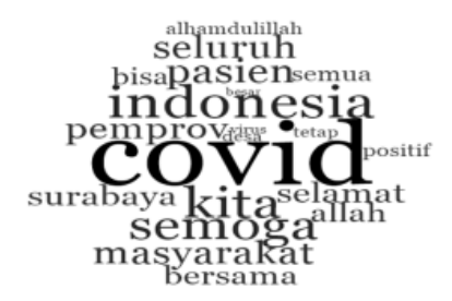
Figure 8: East Java governor's attention to Covid-19 coordination and communication.

East Java is currently the region with the most Covid-19 cases after DKI Jakarta. This was predicted due to the residents' high mobility. Hence, the governor's twitter account (figure 8) serves a very important purpose. The pandemic has become a major concern among the inhabitants, as a result, there is a need to convey all relevant information including government management policies and public participation requirements. Furthermore, the words "Indonesia" and "we" are often used to imply a joint effort in saving the country and the need to comply with implemented health protocols.