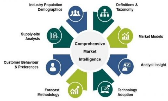
Figure 1: MI framework The Comprehensive of MI.

Figure 1 presents that since the presence of the MI system, funds planning or budgeting can also be carried out appropriately. Because through this system a company will be led to conduct surveys in order to obtain various data obtained. The results in the form of data that are then processed will help determine the various efforts that need to be made as to the next stage. To determine various efforts, a budget is definitely needed. Therefore, fund budgeting needs to be done properly so that every step taken by the company tends to be efficient.