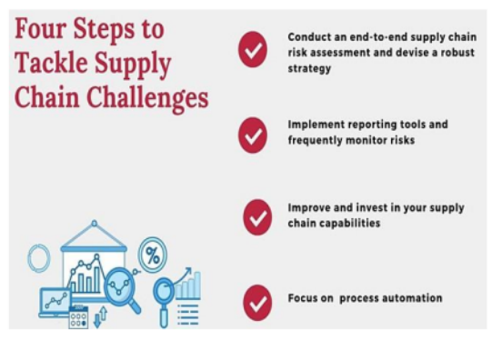
Fig.1: Supply chain strategies and challenges

The government is committed to continuing to work very hard as a form of seriousness in handling Covid-19. This commitment is formulated through the making of public policy (strong public health policy response) related to the handling of the outbreak in the form of drug and medical device supply chain management.