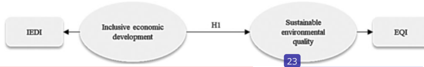
Figure 2: Research model pathway analysis

Sustainable environmental quality represented by the Environmental quality index (EQI); Inclusive economic development represented by the inclusive economic development index (IEDI)