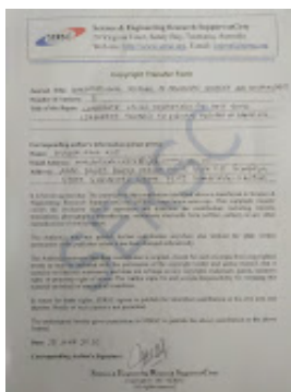
Authors Agreement.JPG 130K