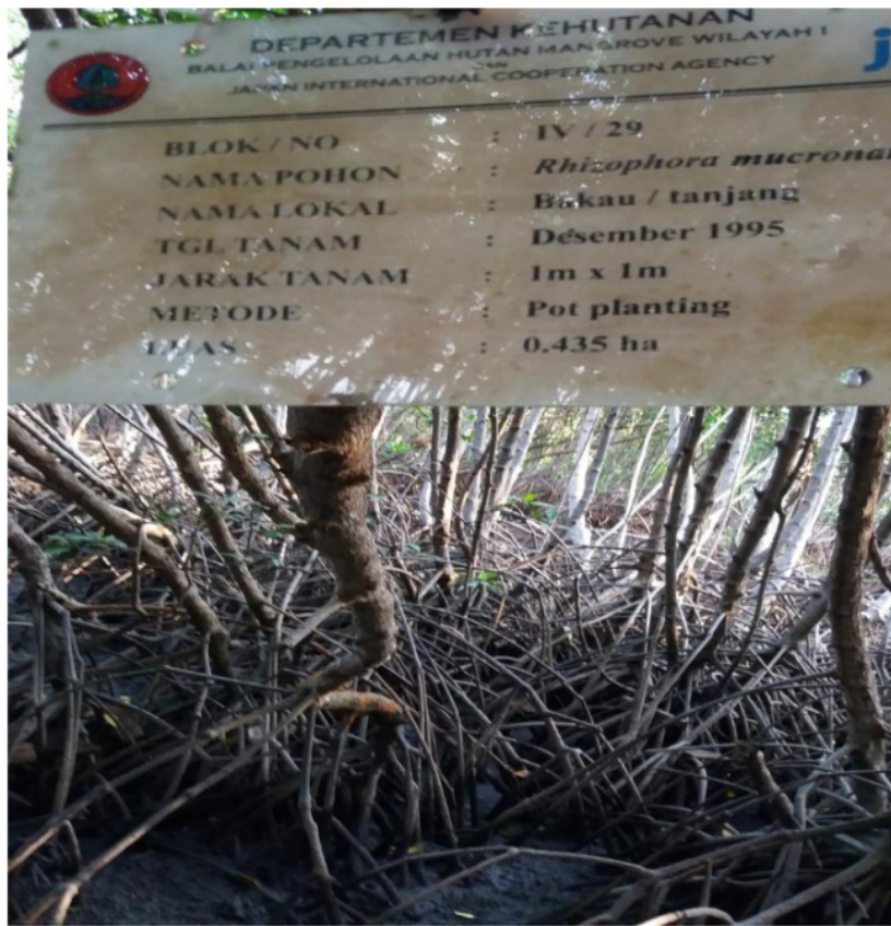
Figure 1. Photo Signboard / signpost for mangrove planting