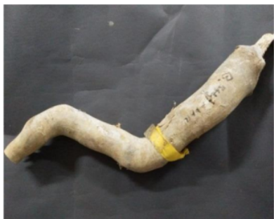
Figure 1 Photograph of pasak bumi root wood

The E. longifolia wood roots (figure 1) used in this study were from Tumbang Atie Village, Sanaman Mantikei Katingan District of Central Kalimantan Province.