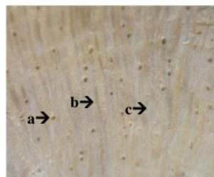
Figure 2 General view of the transverse section: a.Vessel with diffuse porosity and radial arrangement. b. Rays. c. Fibers.

Vessels in transverse sections are round in shape (figure 4), whereas in tangential and radial sections, they appeared elongated like a tube, as reported by Mandang and Pandit [11]. Grouping of the vessel is almost entirely solitary and was being surrounded by other tissues or not connected to other vessels (figure 4) following the explanation of Wheeler [12] and Vilet [13].