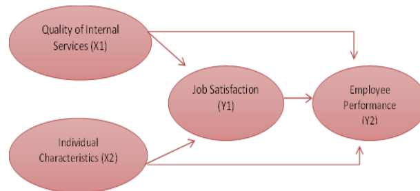
Fig-1: Variable design

H5: Job satisfaction affects employee performance.