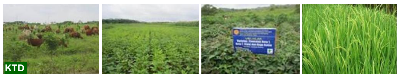
Figure 6. Rehabilitated lands management at KTD (fast growing and agriculture commodities 1-2 years)