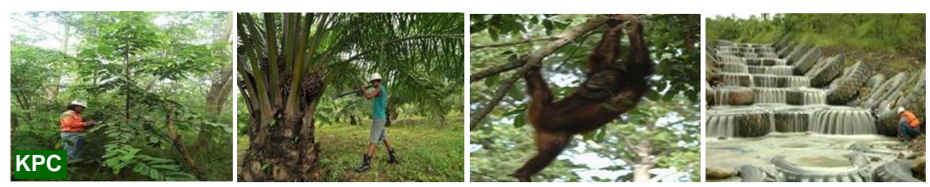
Figure 7. Rehabilitated lands Management at KPC (fast growing, primary species > 10 years, palm oil, soil and water conservation structure)