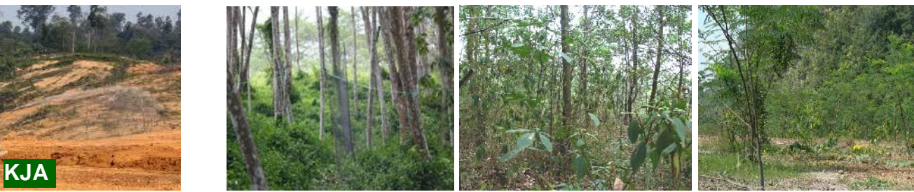
Figure 8. Rehabilitated lands management at KJA (fast growing and primary species > 12 years)