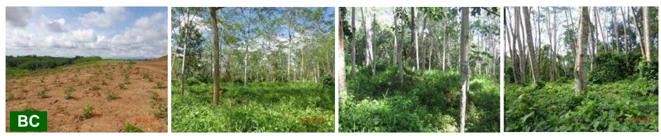
Figure 4. Rehabilitated lands management at BC (fast growing and primary species 10-12 years)