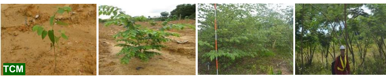
Figure 3. Rehabilitated lands management at TCM (fast growing species-4 years)