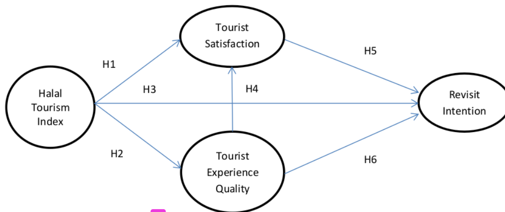
Figure 1. Research conceptual framework