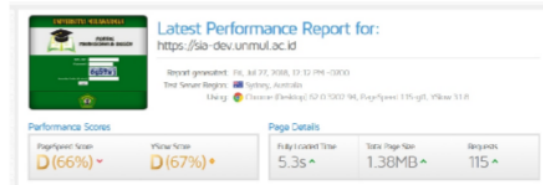
Fig. 2. Performance report of academic student portal

Based on the analysis and calculation of efficiency testing of portal: sia-dev.unmul.ac.id using GTmetrix tool. The grade and score as shown in "Fig. 2" for the performance of PageSpeed score D (66%) and Yslow score D(67%).