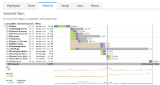
Fig. 5. Response-time load requests webpage of academic student portal

The graph of the response-time measurement shown in "Fig. 5", obtained the average time load of about 5.29s (on-load: 5.09s) with the number of requests of 155 and with the data of 1.4 MB. based on the data, the time load can be said to be "accepted" by referring to recommendations Jakob Nielsen [15] for an acceptable time load of fewer than 10s.