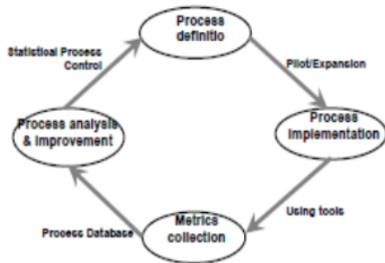
Table 1. Process Improvement Cycle