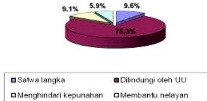
Figure 1. The Urgency of Protecting the Mahakam Dolphins

Mahakam, Ayeyarwady, and Mekong, where there has been a decline in the number and extent of distribution and ongoing threats (Budiono, 2018). Further can be seen in the image below: