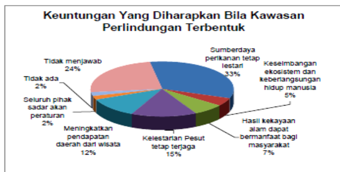
Figure 2. Benefits of the of Protection Areas

Furthermore, the picture below is related to the expected benefits of having the Dolphin Mahakam protected area as the results of research from Rare Aquatic Species Of Indonesia (RASI) and TFCA Kalimantan (Budiono, 2020), can be seen in the image below: