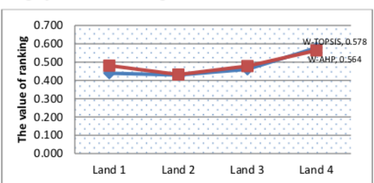
Fig. 3. Results on land with weighting W-TOPSIS and W-AHP

The results of the second phase of the test are known to the output rankings that also recommend Land 4 with the result of the ranking is 0,564. This result showed that both of the rankings are using the weighting TOPSIS directly and it is better than using AHP method, but the second output of weighting in producing alternative decision did not change the output alternative to land 4. The output of the ranking based on the graph as viewed in Fig. 3.