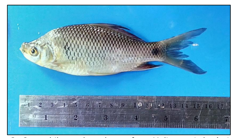
Figure 2. Osteochilus melanopleurus from Melintang Lake (original).

Isolation of bacteria from fish intestine was conducted according to modified Ramesh et al (2015). Fish body surface was sterilized with 70% ethanol to avoid bacterial contamination. O. melanopleurus intestine was removed from the abdominal cavity under sterile conditions, then the intestinal contents were taken out and homogenized. After that 1 mL of homogenized intestinal contents was placed into a test tube containing 9 mL of sterile physiological solution which was serialized and spread in Triptic Soya Agar media and that the culture were incubated in temperature of 30°C for 24-48 hours.