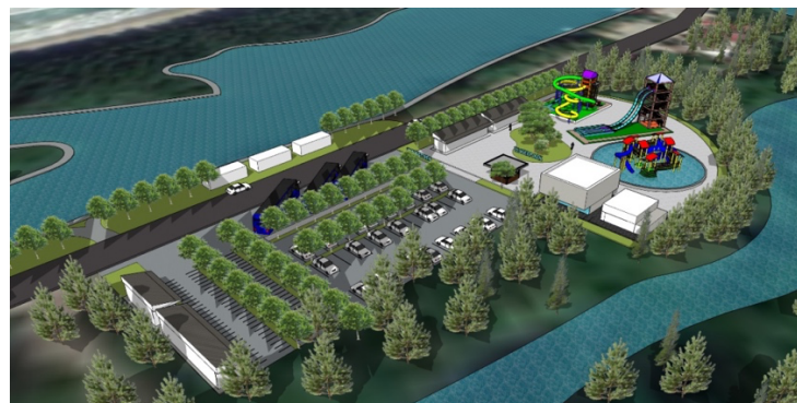
Figure 2. Parking Zone

Location determined as a place to stop vehicles that are not temporary to carry out activities for a period of time.