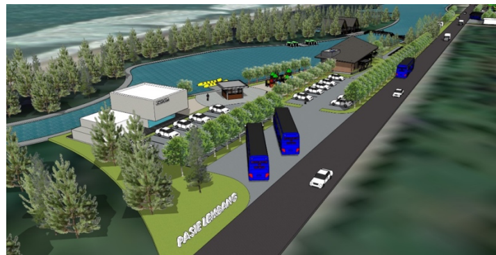
Figure 1. Entrance Zone

The entrance to the Pasié Lembang tourist attraction is designed while maintaining the geographical condition of the village.