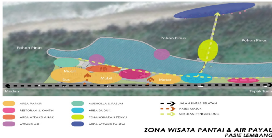
Figure 3. Natural attractions zone

In the tourist attraction zone, Pasie Lembang village has a very large potential to be developed. In this planning, the tourist attraction zone in Pasie Lembang village is divided into 2, namely: natural tourism and artificial tourism.