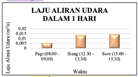
Figure 2. Airflow rate chart in 1 day in the tool room Article Error

Based on the measured parameters, the results of the calculation of the air flow rate in natural ventilation in the tool room are obtained. The parameters are wind speed, cross-sectional area and effectiveness of the opening of the cross-sectional area [8]. Figure 2 is a diagram of the results of the air flow rate in 1 day in the tool room.