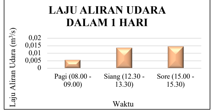
Figure 2. Airflow rate chart in 1 day in the tool room

Based on the measured parameters, the results of the calculation of the air flow rate in natural ventilation in the tool room are obtained. The parameters are wind speed, cross-sectional area and effectiveness of the opening of the cross-sectional area [8]. Figure 2 is a diagram of the results of the air flow rate in 1 day in the tool room.