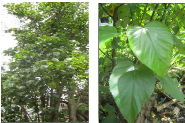
Fig. 1: Plant Melochia umbellata (Houtt) Stapf var. degrata K

The secondary metabolite compounds content in leaf tissues of M. umbellata is essential oils, terpenoids, alkaloids, flavonoids, steroids, and saponins [6,7]. It is also found a group of compounds; saponins, anthraquinones, and triterpenoids cycloartan [8]. Furthermore, the methanol extract of the bark of M. umbellata contains of alkaloids, flavonoids, terpenoids, phenolic, and saponin [9,10]. Several secondary metabolite compounds which have been isolated from the M. umbellata plant and have useful biological activities such as the 3-acetyl-12-oleanen-28-oat (Fig. 2a) compound has the highest inhibitory activity against the growth of bacteria B. subtilis and fungal C. Albicans [10]. Stigmasterol compounds (Fig. 2b) are potentially as an antibacterial, compounds of 9.10-epoxy melochinone are toxic to Artemia salina , murine leukemia P-388 cells [11], and 6,6'-dimethoxy-4,4'- dihydroxy-3',2'-furanos-isoflavan.