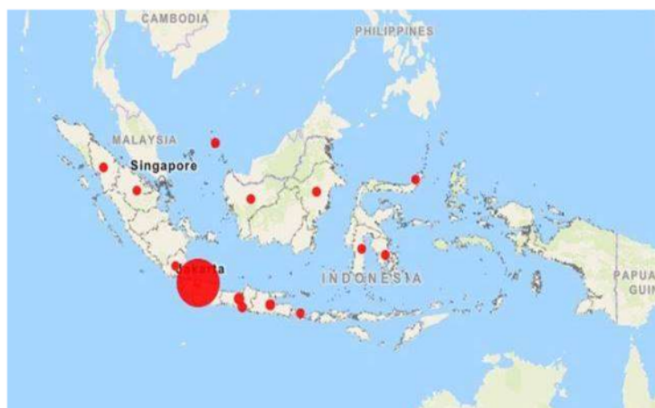
Figure 2. Blocking zone (Source: The Harian Jogja, 2020).

Recent studies that highlight geographical opportunities and weaknesses from demographic pressures in the face of the Covid-19 pandemic emergency support the scientific facts above. Covid-19 threatens to lose from this crisis, undermining the long-term social health insurance system, accumulating in social financing (Sparrow et al., 2020). Economic motives to dampen structural changes that are oriented to the strength of solidarity from the layers of society to contemporary ideas (Abdi et al., 2021). A transferable approach to an island-based country. Social responsibility makes people aware of prioritizing social actions (Sundawa et al., 2021). This truth became a 'topic of conversation' around the world because Indonesia changed the mode, which was originally a large-scale lockdown with full control of the central government, now returned to local governments (city – district – province).