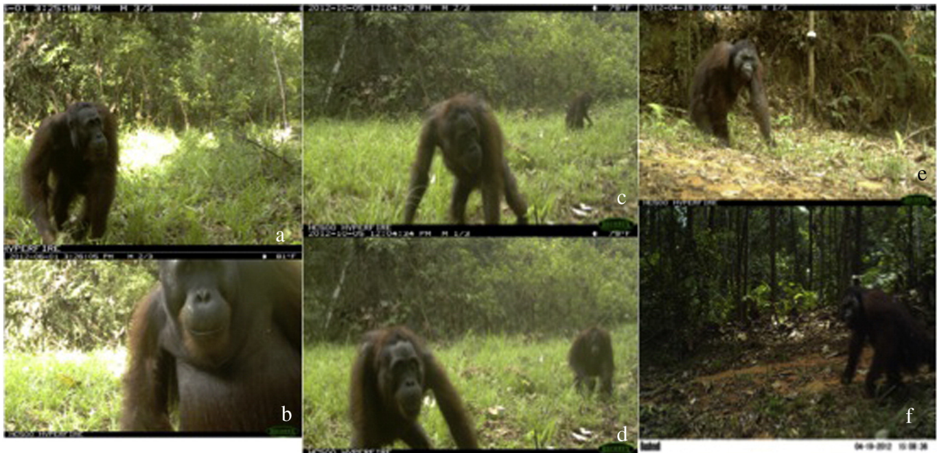
Figure 2a (top) and 2b (bottom). Two photos from one record of unflanged male.

We estimated SCR model parameters using Maximum Likelihood Estimation (MLE). To obtain the MLEs of the SCR model parameters it is necessary to prescribe a 2-dimensional region within which individual home range centers may exist. This region is called the state-space ( S ), and the population size parameter N corresponds to the number of individuals having home range centers within this region. While the population size is sensitive to the size and configuration of the state-space, the density of individuals, D , defined as N divided by the area of the state-space S , is invariant to the size of the state-space under standard SCR models (Royle et al., 2013; p. 132). For our analysis we defined the state-space by buffering the minimum area rectangle containing the sample locations by 7.5 km. The total area of this state-space is 568.8 km 2 . This buffer around the sample locations is at least 4 times the estimated value of \sigma .