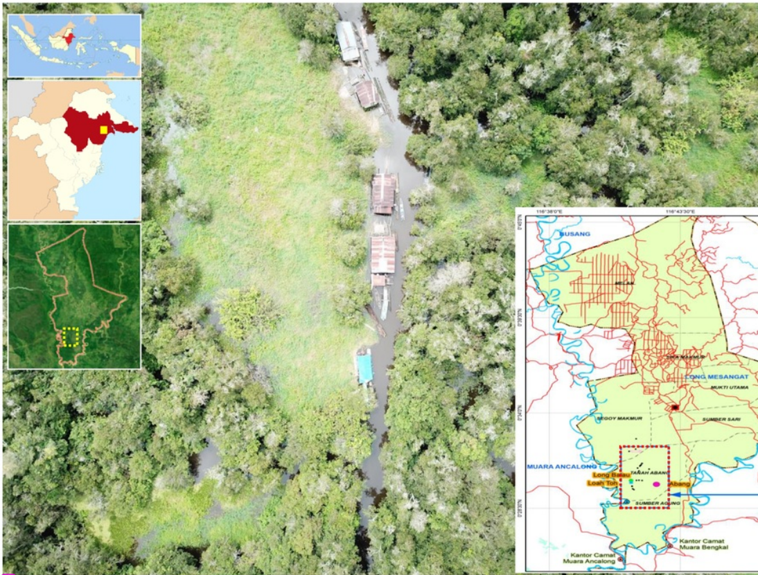
2 Figure 1. Location of study sites in the Mesangat Lake, Subdistrict of Long Mesangat, East Kutai District, East Kalimantan Province, Indonesia. Aerial photograph of Mesangat Wetland Area taken from Ulin Foundation, Samarinda, Indonesia

Mesangat Lake is located in Long Mesangat Sub-district, East Kutai District, East Kalimantan Province located between 00°30'07" North and 116°41'54" East (Figure 1). The lake covers an area of 18,500 hectares, located between the Kelinjau River and Telen River.