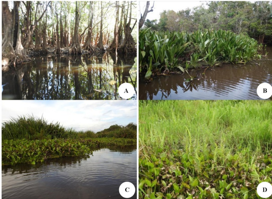
Figure 2. Vegetation types in Mesangat Lake, East Kalimantan, Indonesia. A. Lophopetalum javanicum (perupuk), B. Hanguana malayana (bakung), C. Eichhornia crassipes (eceng gondok), D. Leersia hexandra grass