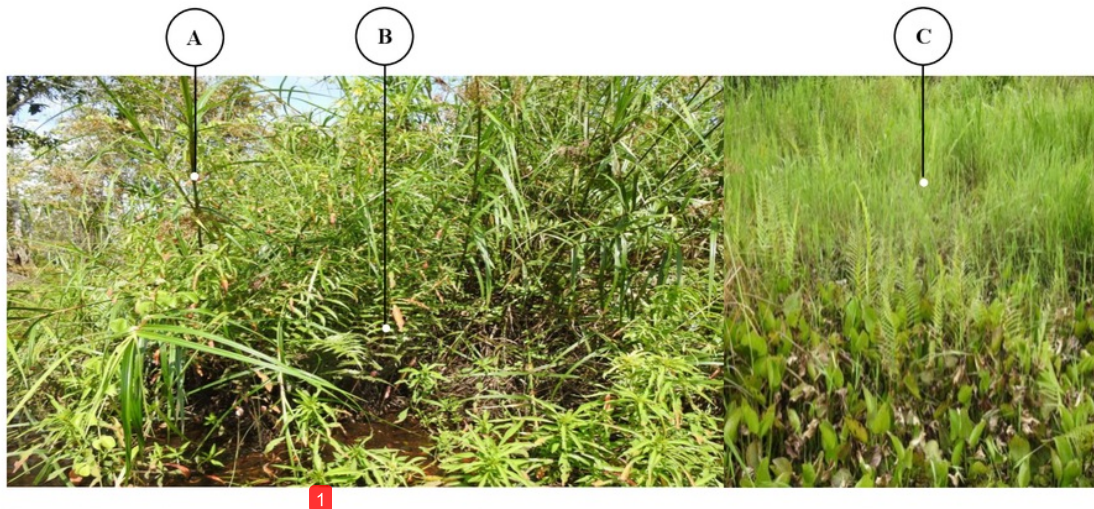
Figure 5. Types of plants making up Siamese crocodile ( Crocodylus siamensis ) nests in Mesangat Lake, East Kalimantan, Indonesia. A. Scleria sumatrensis (predang), B. Cyclosorus interruptus (swamp fern), C. Leersia hexandra (swamp grass)