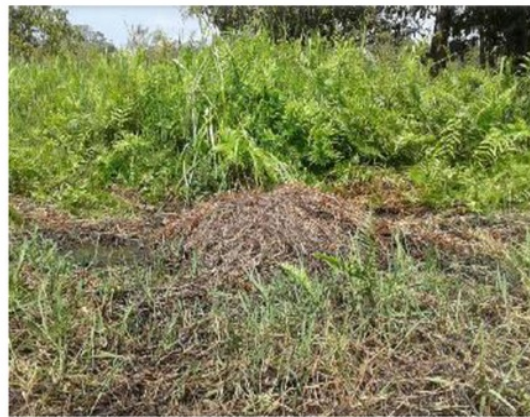
Figure 4. Nests of Crocodylus siamensis