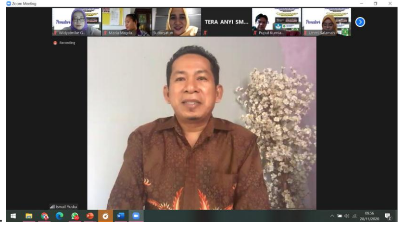
The Head of the Kongbeng District Education Service Unit gave a speech as the host