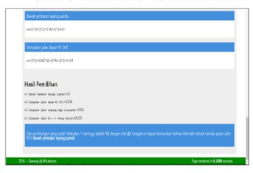
Fig.4. Green Open Space Recommendation