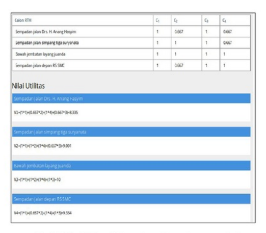
Fig.3. Utility Value of Green Open Space Recommendation