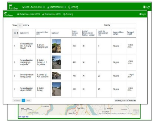
Figure 2 describes the admin page to input the GOS alternative location. Based on the results of recommendations with SAW computing, the best location as the top priority for the new location of GOS Kota Samarinda is the location on Under the Juanda flyover. Then second priority at Border Parks of RS SMC, then Border Parks of intersection

Suryanata and lastly on Border Parks of Drs. H. Anang Hasyim (Fig. 3 and Fig 4).