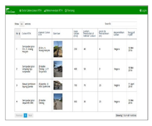
Fig.2. Admin Page for Input GOS Alternative