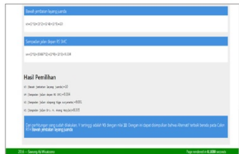
Fig.4. Green Open Space Recommendation