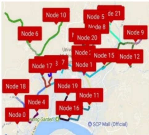
Figure 1. The Route Graph Between the Nodes

The creation of distance tables will be based on the weighted distance information between the nodes of the route graph formed using the Google Maps API in Figure 1 and Figure 2.