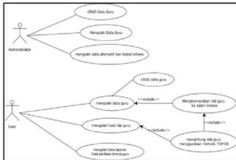
Figure 1. Use Case Diagram of Teacher Performance Assessment

Use Case Diagram has 2 actors namely user and admin, presented in Figure 1.