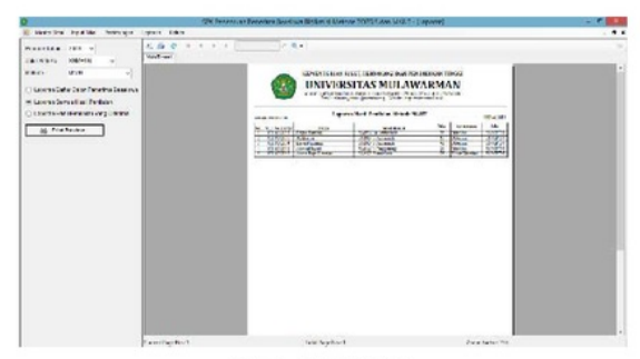
Fig. 6. Report Page

The report is the page used by the admin to print the report. There are several things to do before printing the report, which is choosing the school year, the selection path, the method used, as well as some data report options that want to print the report of the list of prospective scholarship recipients, the report of all assessment results, and assessment report received. As for the pages of printed reports can be seen in Fig. 6.