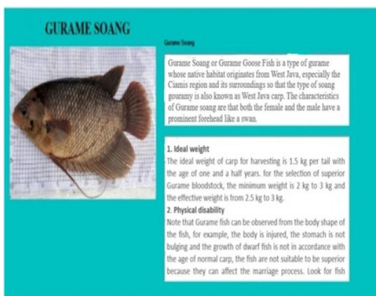
Fig. 8. About Gurame Soang Page