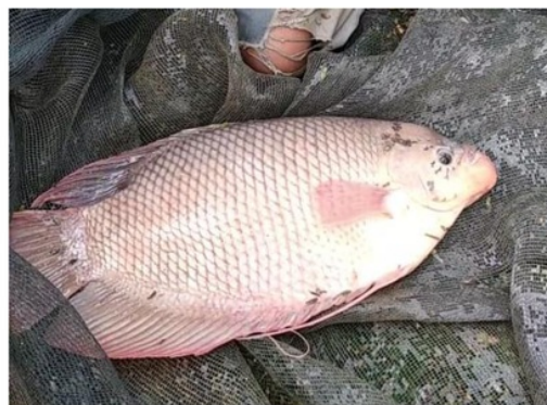
Fig. 1. Gurame Soang